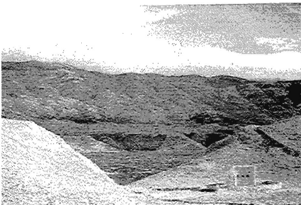
Figure 1: CS 110 kV Toreta under the gust of northern wind

Certain areas along the Croatian coast are more likely to be exposed to bad weather conditions, accompanied by strong northern winds, especially during the winter. The winds, known as «bura», make mist out of sea-water droplets. Considering that the saltiness of Adriatic Sea is very high, from 35-38 ‰, the mist consists of large amounts of salt. (figure 1).