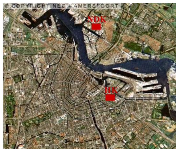
Figure 2. Substations in crowded downtown Amsterdam

To solve this capacity bottleneck, a major investment is required. Because the cable will have to cross a very crowded downtown with numerous canals, a conventional cable installed in a new trench in Amsterdam is prohibitively expensive (figure 2). Additionally, obtaining permits for a project of this magnitude will be expensive, time consuming, and difficult.