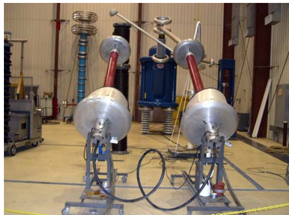
Figure 1 MV cables undergoing ac breakdown testing after long term wet ageing

Early cable systems tended to have low breakdown strengths [4], especially after aging. Thus it was relatively straightforward to achieve true cable breakdowns (punctures of the dielectric within the active length – central portion of Figure 1) and produce a dataset essentially free of termination failure and flashovers. However, improvements in the quality of cable has led to an increase in dielectric strength. This leads to the increased likelihood of test termination failures and flashovers (Figure 2). In addition, some HV test sets now have insufficient voltage to cause failure. These features are commonly referred to as “censored data” or “suspensions” [5 - 8]; which can most conveniently be thought of as failures that have occurred but not by the mechanism under study. The increasing proportion of these censored data reduces the number of valid data points available for analysis. The larger the number of true failures, the clearer and more significant the test conclusions will be.