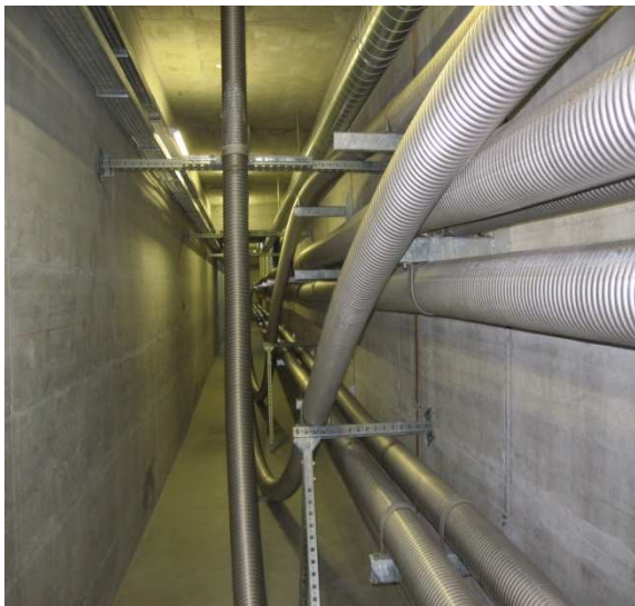
Figure 1.: Installation of XLPE cables with cooling protection

To cope with the ever-increasing electric power demands in metropolitan areas will require a greater underground cable transmission capability. Since it will be difficult to obtain permission for new cable routes, especially in densely populated areas, cables will be installed closer together plus crossing of cables will be more common. The heat generated by the cables creates a problem by reducing the transmission capacity of the circuit. Several ways of cooling the cable using separate cooling systems have been described for cables in tunnels in Berlin, Vienna and Osaka [1], [2]. This means that the cables and water pipes are laid separately and in two stages with both systems in need of mechanical protection. To install an effective cooling system, first the hot spots along the route must be identified and then the hot spots cooled using special installations of cooling pipes. To improve cooling efficiency and ease hot spot mitigation, engineering development work was carried out to develop a cable system that could be directly cooled by adding an encompassing water pipe to the cable.