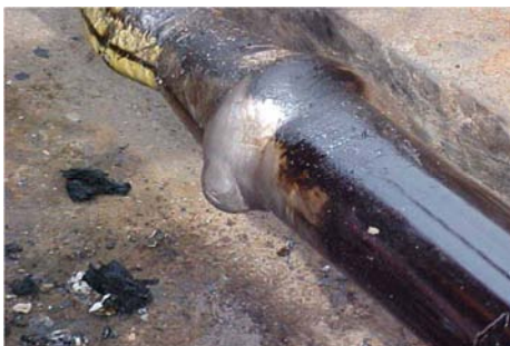
FIGURE - 1 FAILURE MODE FOR INTERNAL PRESSURE

Oil fluid cables have in the region of joints sleeve soldering made with lead alloy that possess the function of sealing leakage of oil for an indefinite time. The soldering process is completely manual, requiring great skill and mastery. In general, the life expectancy exceeds 30 years and thereafter the majority of the defects resulting from over temperature due to short-circuiting across the life and temperature due to overloads. The mode of thermal fault is shown in Figure 1, where a lateral protrusion visually observed occurred due to the insulating oil pressure exactly in the joint sleeve.