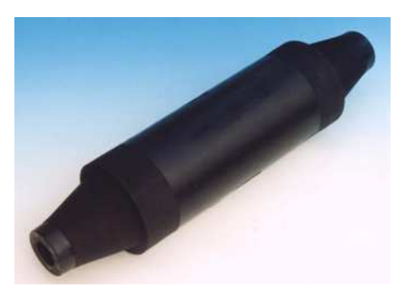
Figure 1: Pre-molded joint