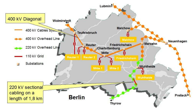
Fig.1: Berlin's 400 kV Diagonal Link

Again the option was to make reuse of the well proven 400 kV oil-filled cable technology or to dare the next technology step in extending the well known XLPE insulating technology from the 110 to the 400 kV voltage level.