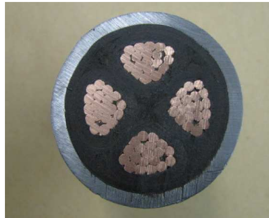
Figure 1 – Cable A: 1937 PILC cable, 68 years service

Three samples of approximately 15 meters were cut from each cable. One from each end, with the third sample from the approximate middle of the total length supplied.