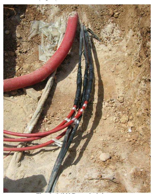
Fig. 2: 24kV Branch Joint

And more than one million units in service worldwide in environmental conditions and multiple voltage classes up to 41.5kV class (Fig. 1).