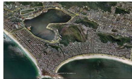
FIGURE – 2 AERIAL VIEW OF SHOUTHERN OF RIO DE JANEIRO CITY

The Rio de Janeiro, in the south, is a city crammed between the Atlantic ocean and forests and mountains, protected by environmental laws and consequently cannot be cut.